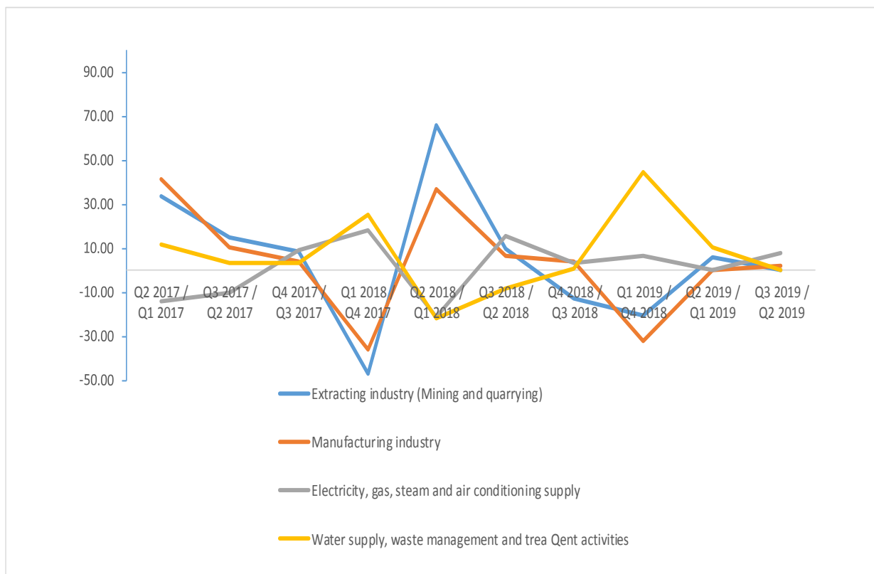
Graph 2. Change of the industrial production volume index by activity B, C, D and E (2017=100)