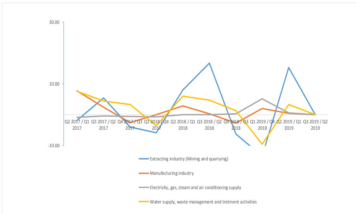
Graph 4. Change of the number of employees by activity B, C, D and E (2017=100)