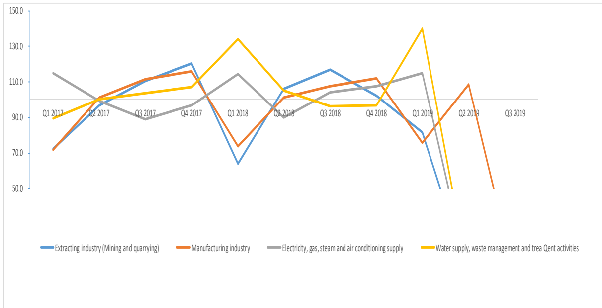
Graph 1. Industrial production volume index by activity B, C, D and E (2017=100)