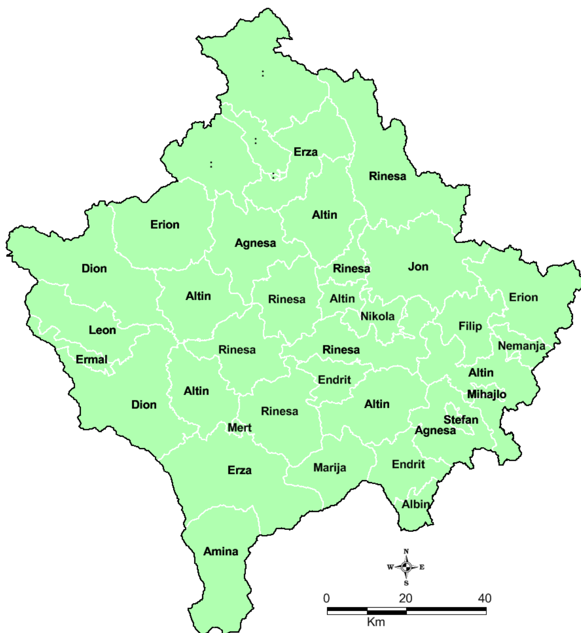
Dominant Names in Kosovo by years 2001-2011