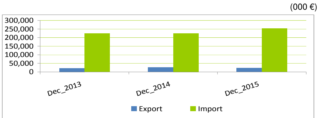
Graph 1: Graph presentation of Export and Import December 2013-2015

According to the data the main groups of export are: (45.5%) base metal and articles of base metal, (13.8%) mineral products, (9.4%) prepared foodstuffs, beverages and tobacco, (6.3%) plastics, rubber and articles thereof, (5.5%) textiles and textile articles, (5.2%) vegetable products etc.